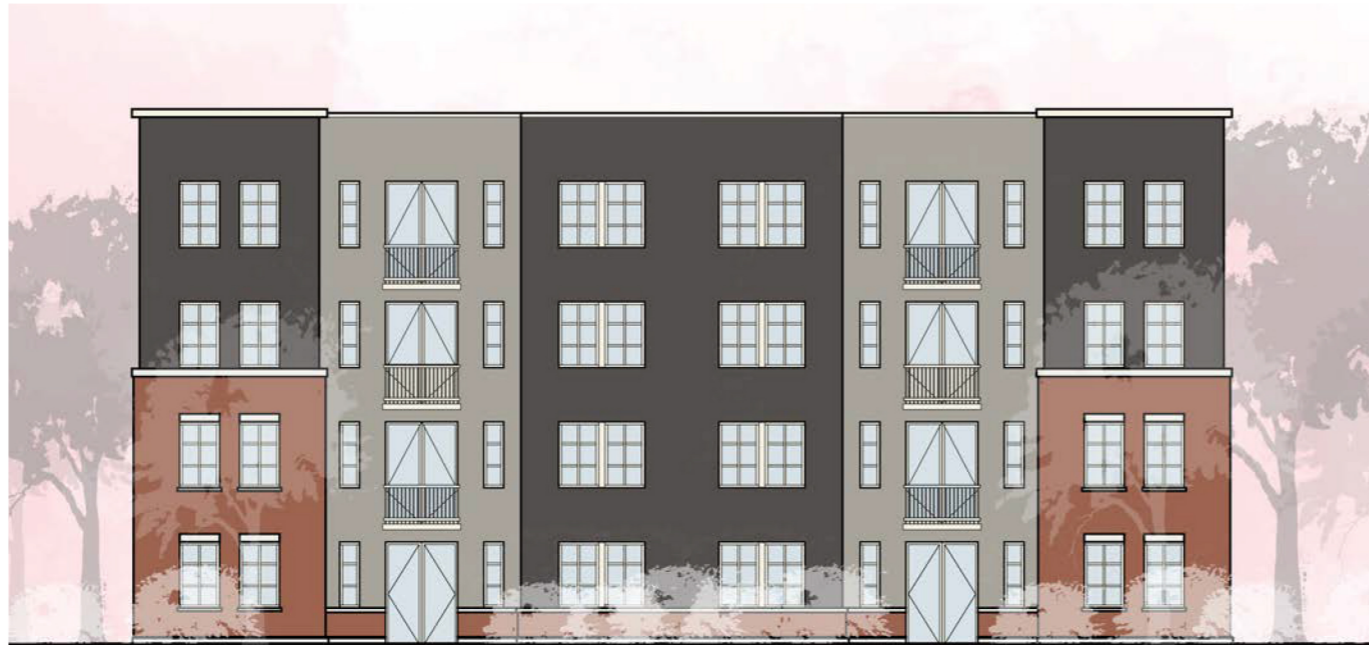
FRONT EXTERIOR ELEVATIONS